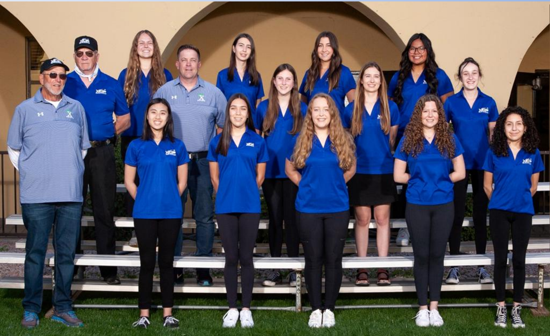
Last Year's XCP Hotshots Clay Target Team 2020-21