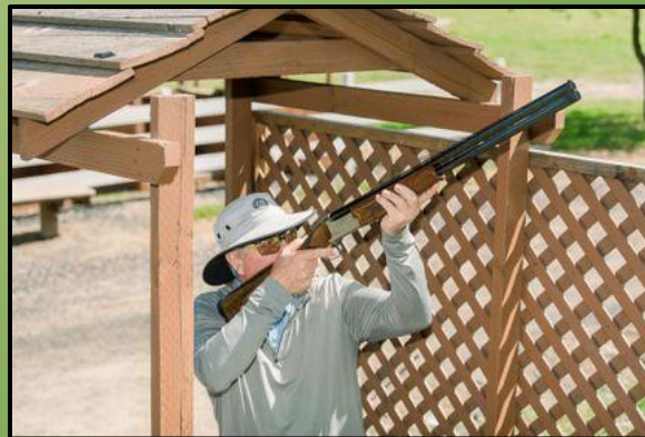
Coyote Valley Sporting Clays CoyoteClays.com