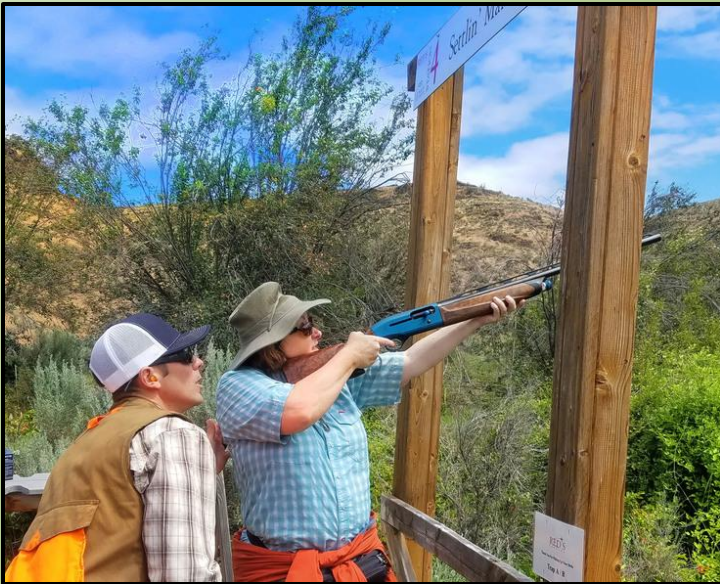
Canyon River Ranch CanyonRiver.net